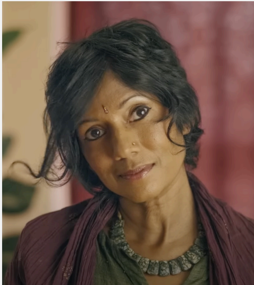
“YOU AND I” (NOBODY IN THE WORLD) BY JOHN LEGEND 2014

Because the organization is based in Los Angeles, I would love to feature as many voices in this film, particularly in outdoor locations and spaces and places where people with disabilities may have been denied. I aim for these women to feel as expansive as possible, especially in environments that often overlook them. I want this film to feel like they are reclaiming those spaces and taking up physical space in new spaces for their community.