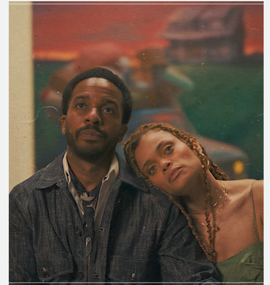
EXHIBITING FORGIVENESS 2024