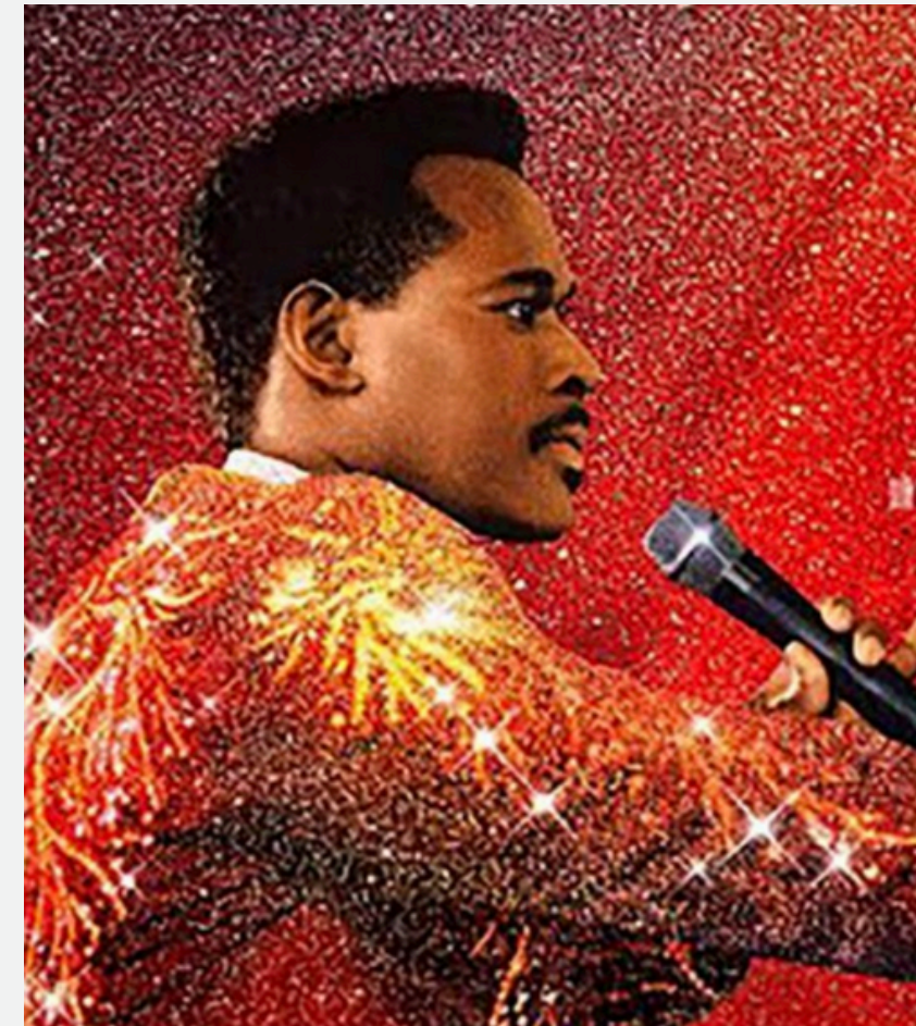
LUTHER: NEVER TOO MUCH 2024